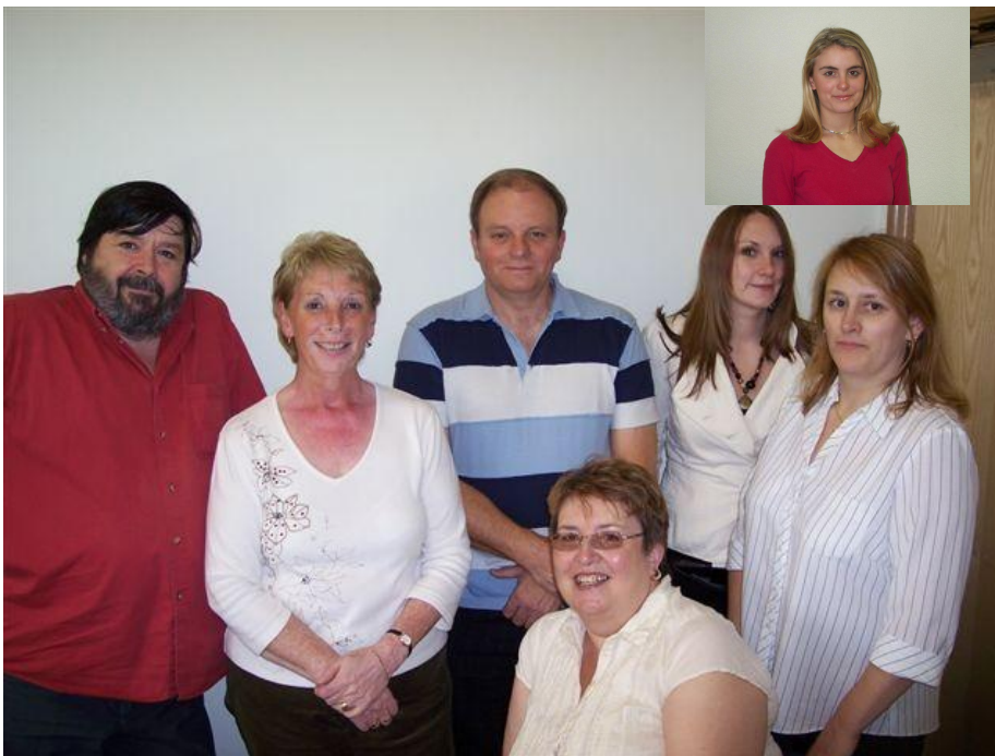
The CISWO Western Region Team, from left to Right